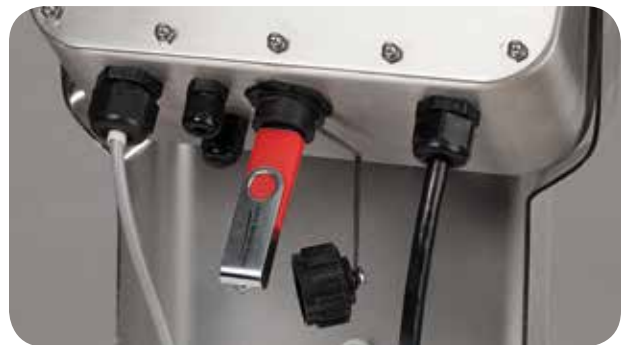
USB with optional waterproof gland