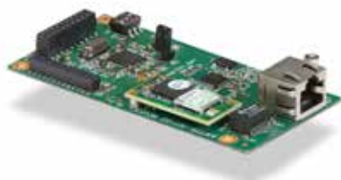
Wireless Card & Antenna Kit 802.11b/g wireless