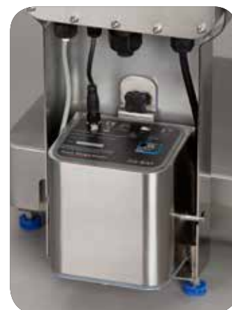
IP69K External Battery Pack Mounts neatly inside column. Toggle on/off. Rechargeable. Provides 16 hours operation.