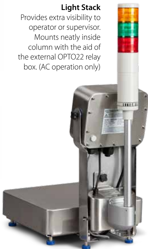
Light Stack Provides extra visibility to operator or supervisor. Mounts neatly inside column with the aid of the external OPTO22 relay box. (AC operation only)