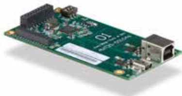
USB Device Card Provides USB interface to PC.