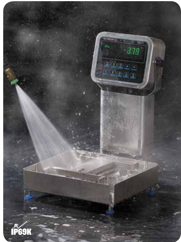
Easy to remove base cover for thorough cleaning

We recognize that good hygiene is vital to business success in the food industry. In line with USDA and other sanitation and hygiene standards, this NSF certified piece of equipment guarantees hygiene safety at all times. The ZQ375 has been designed for ease of cleaning. A smooth pickled and polished surface finish helps to stop microorganisms from growing on the surface of the scale. Curved corners and the easy-to-remove cover make thorough cleaning simple, fast and effective, minimizing food trap areas where bacteria could thrive. All threads are hygienically covered with domed nuts to aid and speed up cleaning processes.